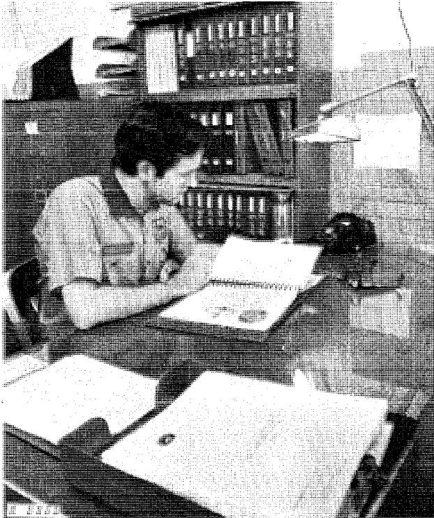
Use FOS Manuals for Reference