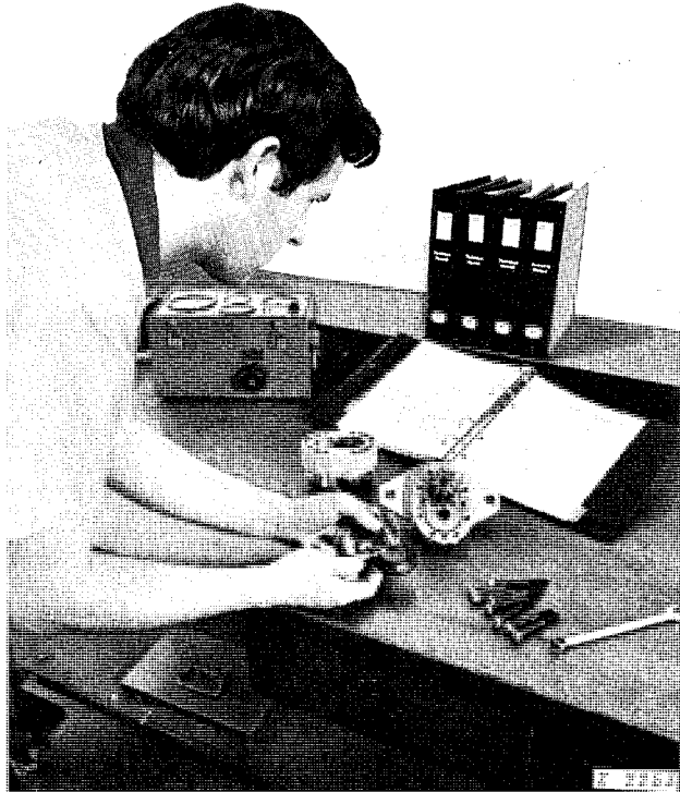
Use Technical Manuals for Actual Service

This technical manual is part of a twin concept of service: